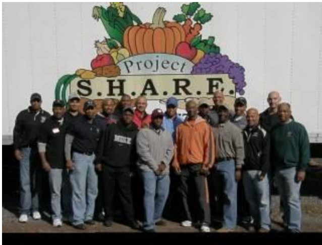
MG Charles C. Rogers Chapter Members

greater Carlisle, Pennsylvania community. The ROCKS augmented the workforce at the food distribution center, broke down, and issued groceries to hundreds of needy families.