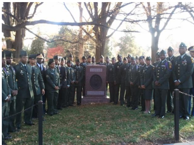
NSU's future leaders with Joe Louis.