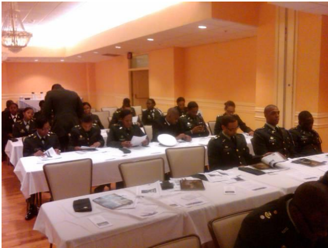
November 2010 Chapter Meeting – DC ROCKS Members and Norfolk State Cadets

The Washington, DC Chapter of The ROCKS, Inc. was very busy over the past three months with monthly meetings and events.