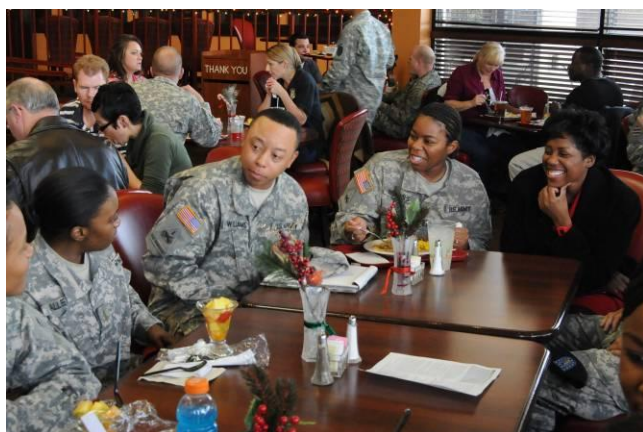
El Paso ROCKS attend December 3 luncheon

Nearly 20 members and prospective members of the Rocks, Inc. attended a re-activation interest luncheon at the Fort Bliss Centennial Club Dec. 3.