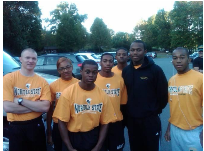
Norfolk State Cadets attend DC ROCKS 5-Mile Race