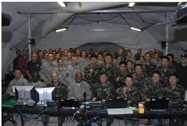
Personnel from the Combined Joint Task Force-Elimination, or CJTF-E pose for a group photo Oct. 20 near the completion of Liberty Focus 2011.

They might have the toughest job in the Army and do it in an environment that would terrify most people, but digging foxholes in Texas dirt in 90-degree weather was the biggest challenge for a couple of CBRNE troops from Fort Lewis, Wash., who participated in operation Liberty Focus at Fort Hood. The lab scenario was part of a training exercise involving more than 500 CBRNE troops from military installations nationwide held on post Oct. 13-21.