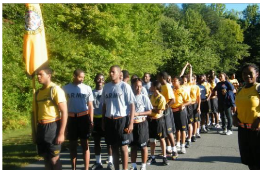
ROTC Cadets line up prior to the race