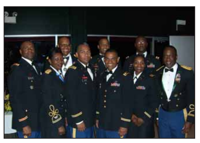
Members of the FLW Chapter of the ROCKS pose with UAPB cadre at their Annual Military Ball

Many of the cadets, cadre and family members thanked the ROCKS members for taking the time for sharing their unique and inspiring experiences and said that the leadership outreach visit definitely made a positive