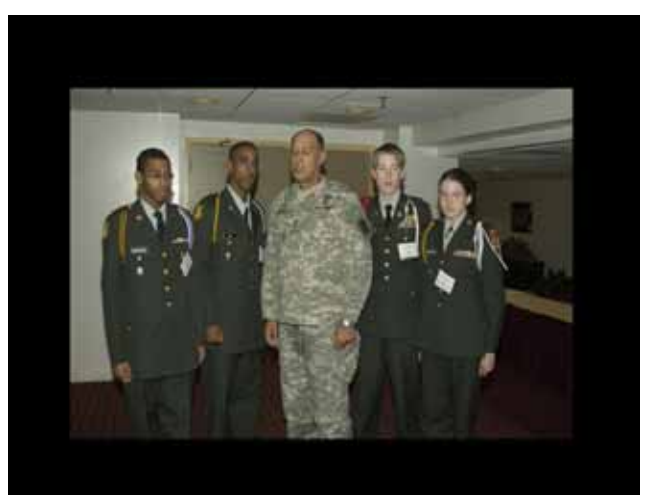
LTG Russell Honore' with cadets from Fort Meade High School ROTC Program

As you can see the conference was jam packed with the best talent the Army had to offer. I am looking forward to the next conference in 2008.