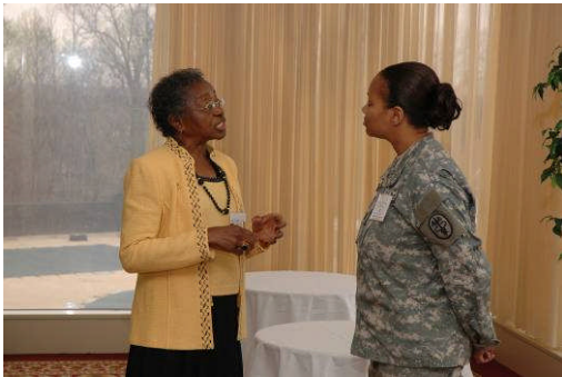
BG Clara Adams-Ender USA (Ret) speaks with conference attendee