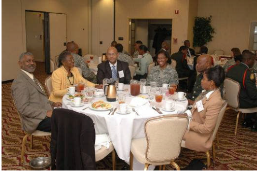
Conference attendees enjoy lunch with BG Clara Adams-Ender USA (Ret) (in yellow jacket)