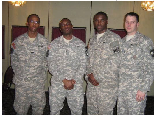
VSU ROTC Cadets at Central VA ROCKS Ceremony