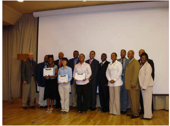
Scholarship Winners with Members of the Morning Calm Chapter