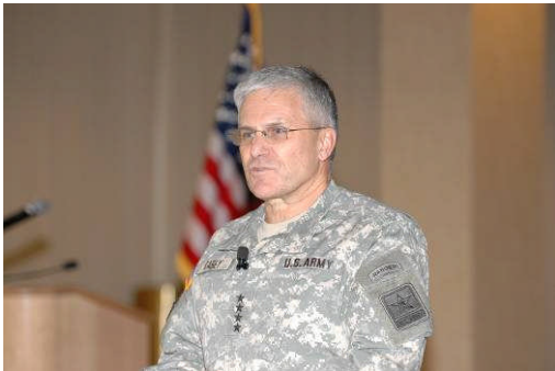
GEN George Casey