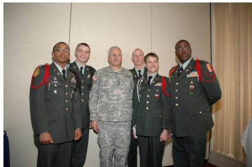
GEN George Casey with Fort Meade ROTC Cadets