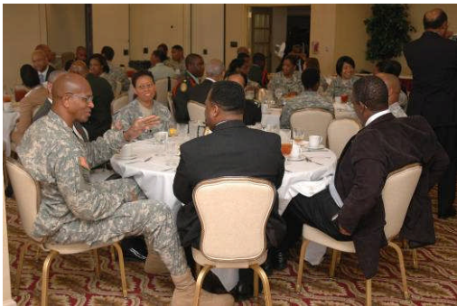
Enjoying conversations during lunch