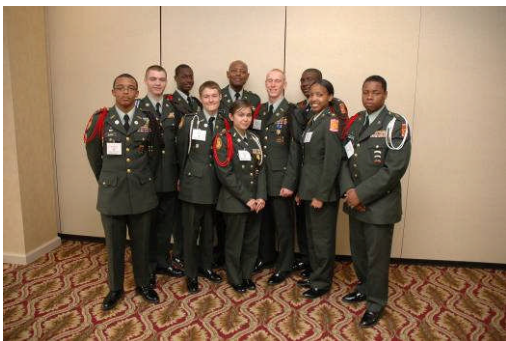
Fort Meade High School ROTC Students