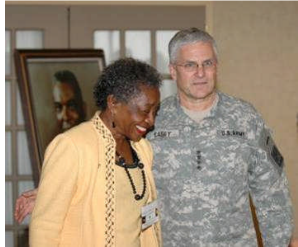
BG Clara Adams-Ender USA (Ret), ROCKS, Inc. National Chairman with GEN George Casey, Chief of Staff of the US Army

"They're the leaders of tomorrow. Plain and simple," Casey said. "That's why it's important to have young men and women interested in what we do. We need people from all over the country, with as many cultural backgrounds as possible. That's what will sustain us as an Army and as a nation."