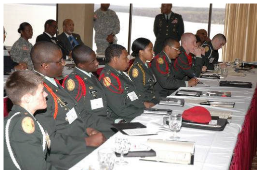
Fort Meade ROTC Cadets listens to the speaker