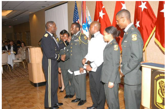
GEN Ward "coins" each of the ROTC Scholarship Awardees