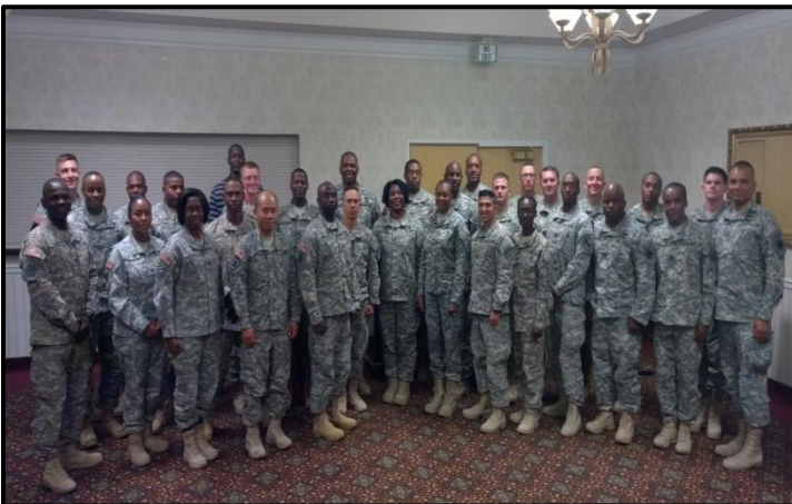
Members of Fort Irwin ROCKS Inc. High Desert Chapter and NTC Army Officers, Senior Enlisted, and Warrant at a chapter sponsored forum.

The Fort Irwin High Desert Chapter continues to contribute to the primary mission of the ROCKS’. A mission with the objective to establish and continually provide the mentorship and the professional development of officers, warrants, and senior civilians. The challenge presented to both the Army senior and junior leaders, as well as the assimilation into Fort Irwin’s community, has thus far proven advantageous in the chapters’ goals. Through the continuous efforts of its’ members, the Fort Irwin High Desert ROCKS’ Chapter will continue to develop a team of members committed to the fundamental goals of effective and sustained mentorship and professional development. The mentor and the mentee can both benefit from this important relationship.