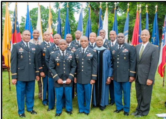
US Army War College Graduation Academic Year 2015 Carlisle Barracks, PA