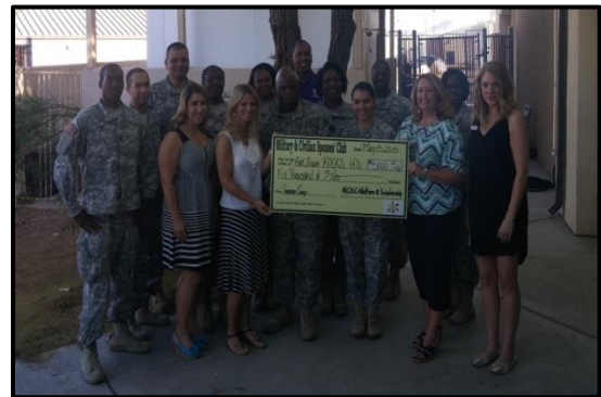
High Desert Chapter receiving Military & Civilian Spouse Club grant.