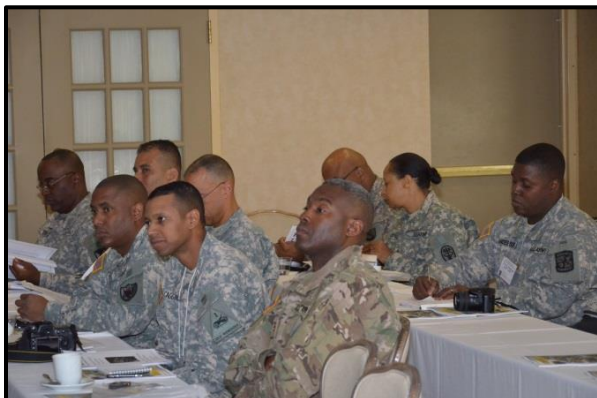
Attendees at 2012 Conference